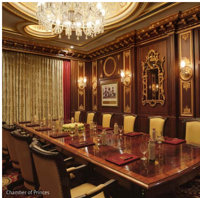
Chamber of Princes

This quiet, undisturbed venue conveniently located away from the hotel rooms, is ideal for both international and national level meetings, and has a capacity for seating 14 guests with plush leather upholstered chairs and an impressive Mahogany table.